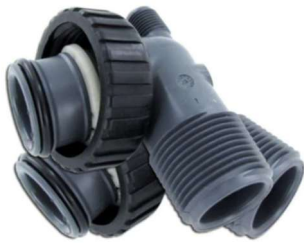
Elbow Connectors (Most Popular)

We offer three (3) types of Clack PVC Connectors as shown below